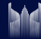
THE DUBAI FOUNTAIN

The spectacular neighbourhood of Arts and Culture